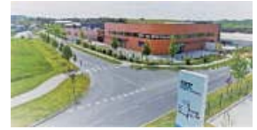
Eagle ABC Technology S.A.S.

2015 ▶ Acquires French subsidiary ABC Technology (presently, Eagle ABC Technology S.A.S.)