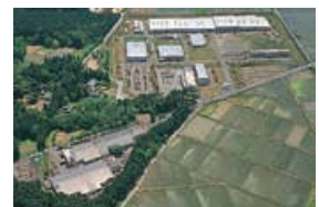
EagleBurgmann Japan Co., Ltd.

1998 ▶ Merges Eagle Machine Works Co., Ltd. and Eagle Precision Co., Ltd. into Niigata Eagle Co., Ltd. (presently, EagleBurgmann Japan Co., Ltd.)