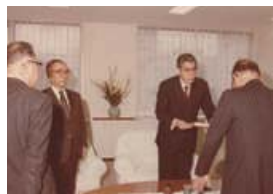
Listing ceremony at Tokyo Stock Exchange

1982 ▶ Lists the Company's shares on the Second Section of the Tokyo Stock Exchange