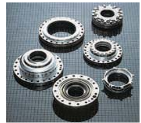
Rocket engine seals

1986 ▶ Supplies engine seals for Japan's H-I rocket