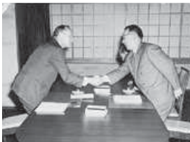
Nihon Sealol Co., Ltd. is established.

1964 ▶ Nihon Sealol Co., Ltd. (presently, Eagle Industry Co., Ltd.) is established.