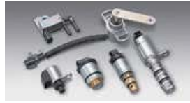
Automotive solenoid valves

2005 ▶ Commences automotive solenoid valve business