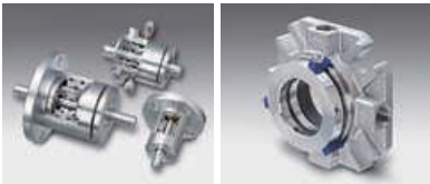
Magnetic fluid seals

2002 ▶ Commences sales of global cartridge seals and magnetic fluid seals