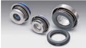
Compact seals for automotive water pumps

1999 ▶ Develops and delivers compact seals for automotive water pumps