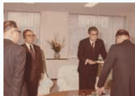
Listing ceremony at TSE

1982 ● Lists on the Second Section of the Tokyo Stock Exchange (TSE)