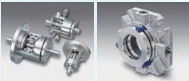
Magnetic fluid vacuum seals Global cartridge seal

2002 ▶ Commences sales of global cartridge seals and magnetic fluid vacuum seals