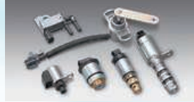
Automotive solenoid valves

2005 ▶ Commences automotive solenoid valve business