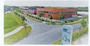
Eagle ABC Technology S.A.S.

2015 ▶ Acquires French subsidiary ABC Technology (presently, Eagle ABC Technology S.A.S.)