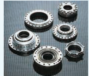
Rocket engine seals

1986 ● Supplies engine seals for Japan's H-I rocket