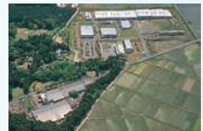
EagleBurgmann Japan Co., Ltd.

1998 ● Merges Eagle Machine Works Co., Ltd. and Eagle Precision Co., Ltd. into Niigata Eagle Co., Ltd. (presently, EagleBurgmann Japan Co., Ltd.)