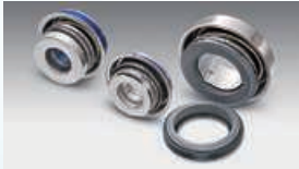
Compact seals for automotive water pumps

1999 ▶ Develops and delivers compact seals for automotive water pumps