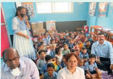
LMN Education Trust (Pune City) Classroom

EBIN, located in India's state of Maharashtra, provides support mainly in the areas of tackling poverty, children's education, and health and medical care, including support for the operation of alternative schools for children from poor families and donations of medical equipment to charitable hospitals.